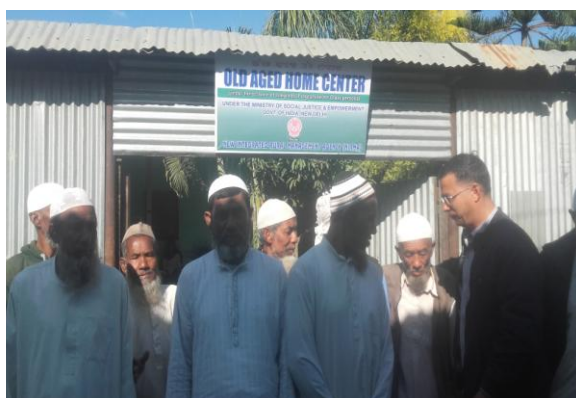
Inmates are gathering when a team of staff of the Hon'ble Chief Minister of Manipur inspected the OAH Centre and showing the inmates when District Social Welfare Officer of Thoubal inspected the centre