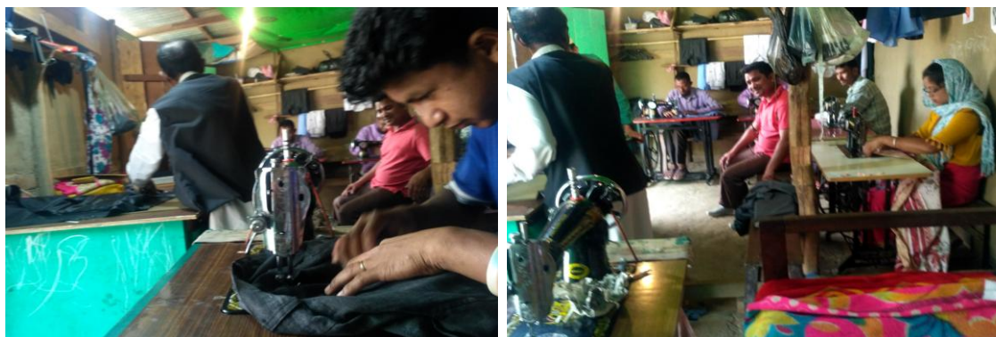
The trained beneficiaries are working in the Production Centre of Master ABO

As the fund of the programme of the "Maulana Azad Education Foundation (MAEF)", Ministry of Minority Affairs, Govt. of India, New Delhi was one time grant for purchase of machine and equipments, no fund was release from the Ministry for the project. But the organization has been continuously running the programme at Nungphou Bazar, Sangaiyumpham Part-I, P.O. Wangjing, Thoubal District, Manipur from the own source of NIRMA. For successful implementation and giving more facilities to the present and passed out trainee NIRMA has opened Production Centre at different places of the villages-Sangaiyumpham Part-I and II. Many trained trainee has opened their own centre and many other working in the production centre. They solved their family socio-economic problem with the income received from the centre and those who opened their own centre got self-help, self-reliant and self-sustained. A selection committee of NIRMA has selected 50 (fifty) numbers of beneficiary/trainee belongs to poor, minority and other backward classes for the project/programme for the year 2017-18.