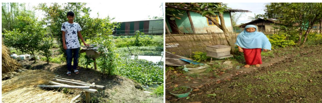
Beneficiaries of the Bee Keeping Programme were near the bee box supplied by NIRMA