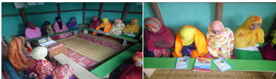
Showing the students of the Maktab in the class room during the period of the Maktab.