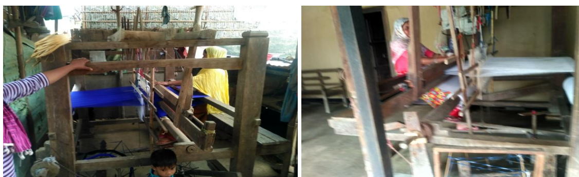
Showing the trainee who have passed out from the centre working in their own place.

During the period, a selection committee has selected 30 (Thirty) nos. of beneficiaries/trainee from different villages and community of Thoubal District of Manipur.