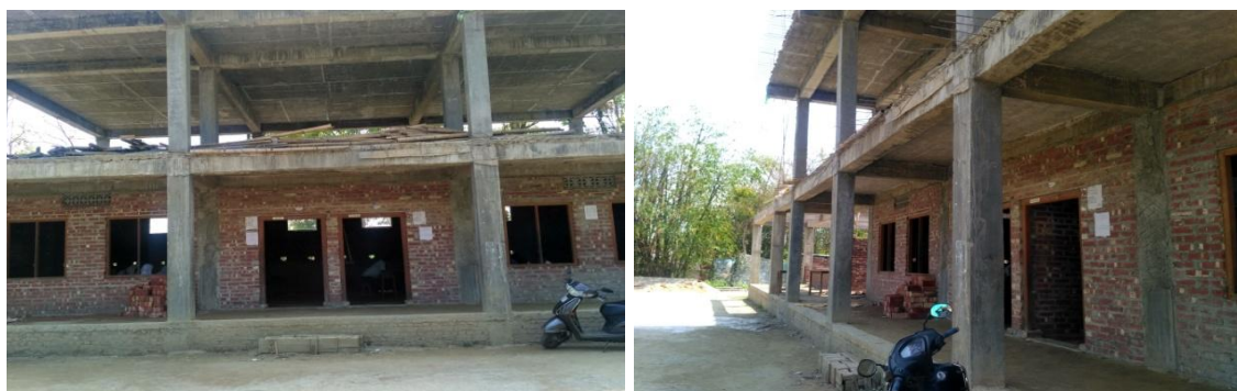
Showing the pucca building of the school with newly constructed 1 st floor of the school