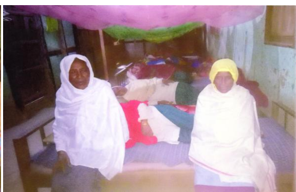
Male and female inmates are taking rest in their wards/beds in the Old Aged Home Centre run by NIRMA