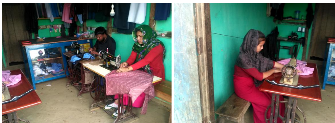
The passed out/trained beneficiary Centre are working in the Production Centre.