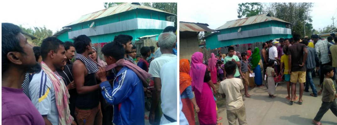
Showing arrest of drug addicts by volunteers of NIRMA with representatives of youth clubs, associations of Lamding, Sangaiyumpham Part-I, Sangaiyumpham Part-II and Samaram.

The organisation has organized "Prevention and Control of Drug Abuse" for one month at Sangaiyumpham Part-I and Part-II, P.O. Wangjing, Thoubal, Manipur. The main objectives of the programme were; i) To sensitize with demonstrations and case studies about the harmful effects of drug abuse; ii) To make mass mobilization for prevention and control of drug abuse with mass media, pamphlets, posters, banners and rallies, etc. The number of drug addict and drug supplier increases day by day like flood in Manipur mainly in Thoubal District among valley districts of the State. In close consultation local youth clubs, associations and mahila mandals NIRMA has formed a body for prevention and control of drug abuse and to identify drug addict persons. Expert resource persons from the Department of Social Welfare, Government of Manipur delivered valuable talks about the programme and they suggested for opening a project for de-addiction with assistance from the Government of India. Volunteers of NIRMA observed at different crossing point of the villages for coming of drug addict persons to the villages.