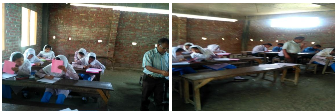
Teachers and students were in the classroom during monthly examination of the school